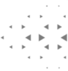
Table 3 (continued)